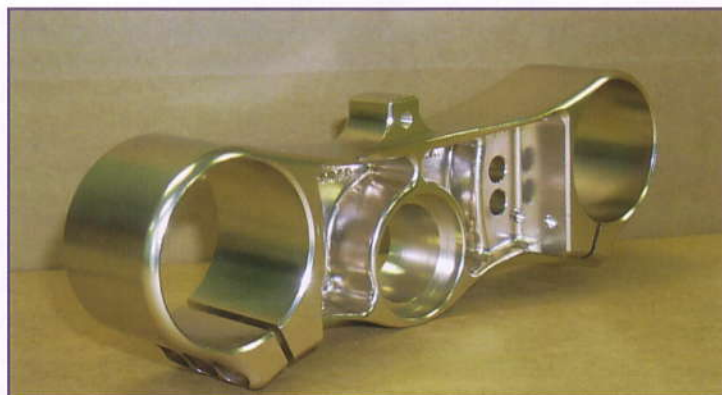
C. Finish Forged and Machined Motorcycle Triple Clamp

Wouldn't you rather machine the forging in picture B. to get to the final product shown in picture C.?