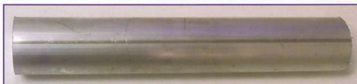
A. Billet Aluminum or Bar Stock

Forging allows you to reduce your machining time and improve your part quality. By providing you with a shape that significantly reduces, or potentially, eliminates machining, your costs can be drastically reduced over other methods.