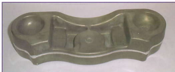
B. Forged Aluminum Motorcycle Triple Clamp

Wouldn't you rather machine the forging in picture B. to get to the final product shown in picture C.?